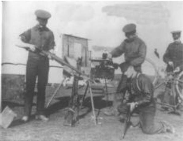
Armourers of the Royal Canadian Army Ordnance Corps, Salisbury Plain August 1914.

From the book, "The Worlds Worst Weapons" The author berates the Ross Rifle for its poor performance in the trenches. Two of the Armourers are posing with Ross rifles, but of interest are the Portable Tool Box/Bench and the Corporal in the background working on a bicycle.